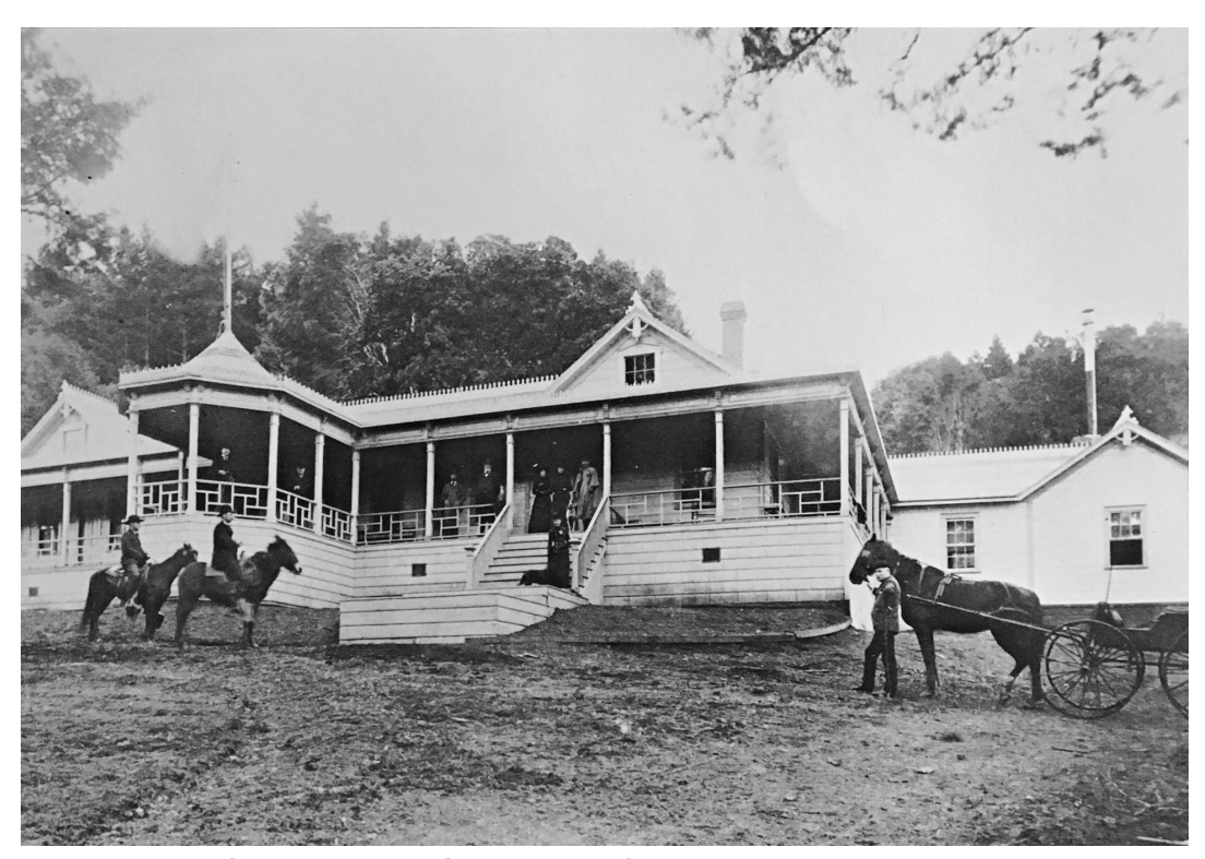
"The Country Club" of Bear Valley / 1890